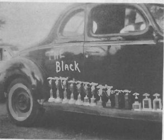
Windell Smith's Hot Rod