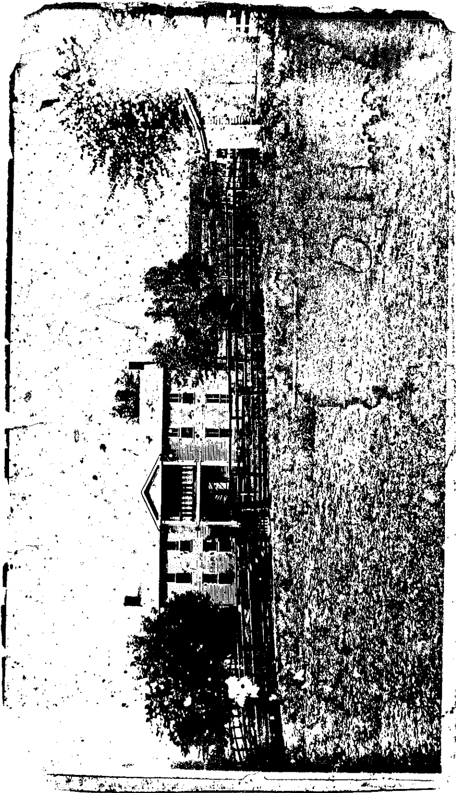
WILLIAM JESSE WOOD HOME